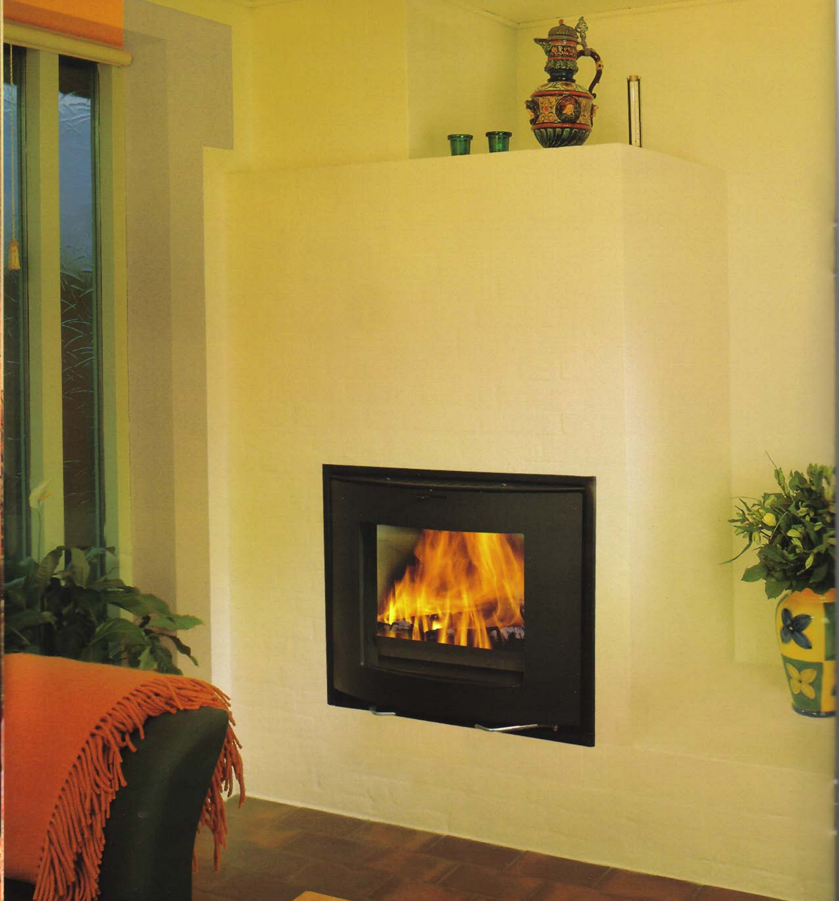
SCAN DSA 4 shown in black paint with optional four sided surround trim