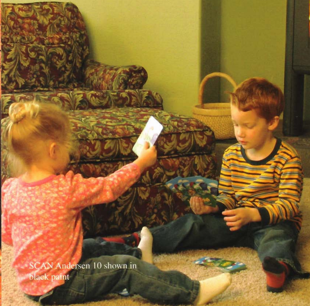
SCAN Andersen 10 shown in black paint