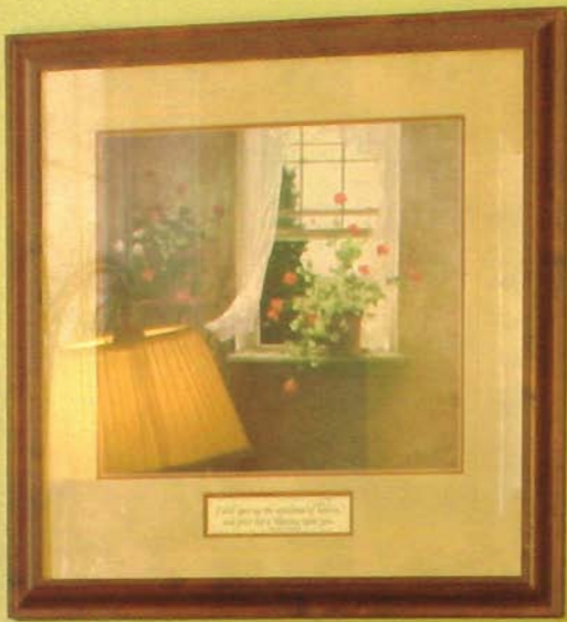
Andersen 10 shown in black paint