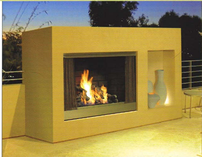
Unit illustrated is a OFP42NS Outdoor Fireplace in Stainless Steel – Natural Gas, LOGF37 Split Oak Log Set, OFP42RLT Traditional Brick Liner.