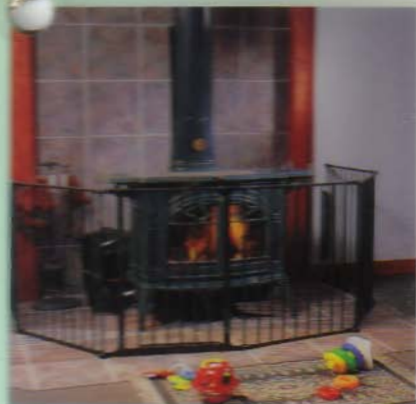
Shown with optional G70-24" section