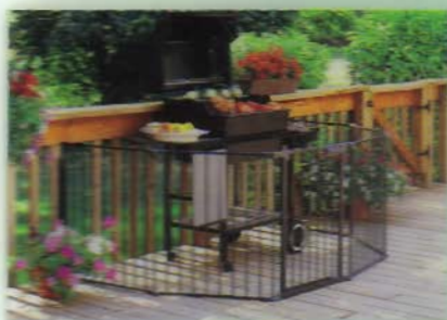
Shown with optional G70-24" section