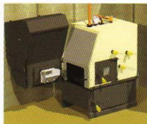
Hopper swings open for access to burn pot.