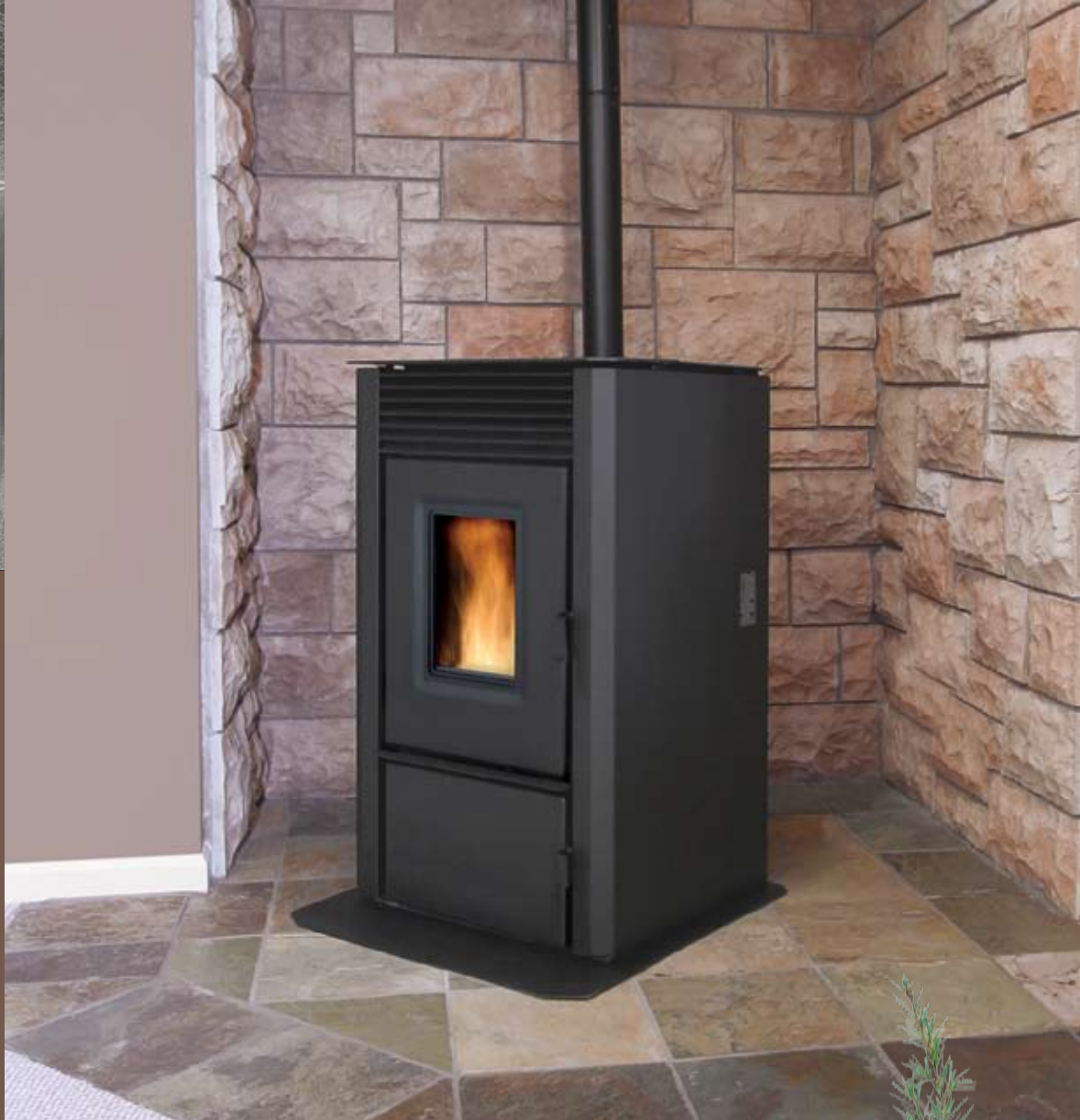
Extra Large Freestanding Pellet Stove